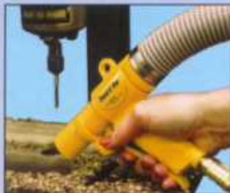
#2001 HAND-E-VAC Industrial Cleaning Gun

Other innovative maintenance products from ITW Vortec