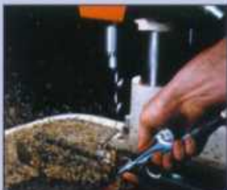
#9401 BLOW GUN With Adjustable Nozzle

Due to a policy of continuous development we reserve the right to change specifications without notice.