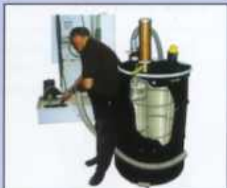
#2108 SUMP-N-ATOR Chip & Sludge Separator